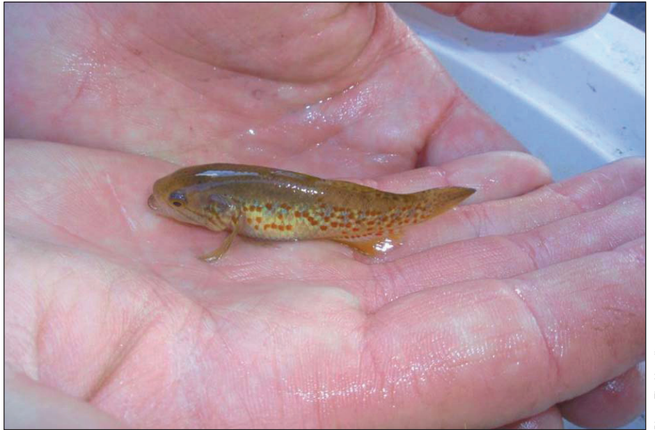
Plate 16.1 Purple-spotted gudgeon ( Mogurnda adspersa )