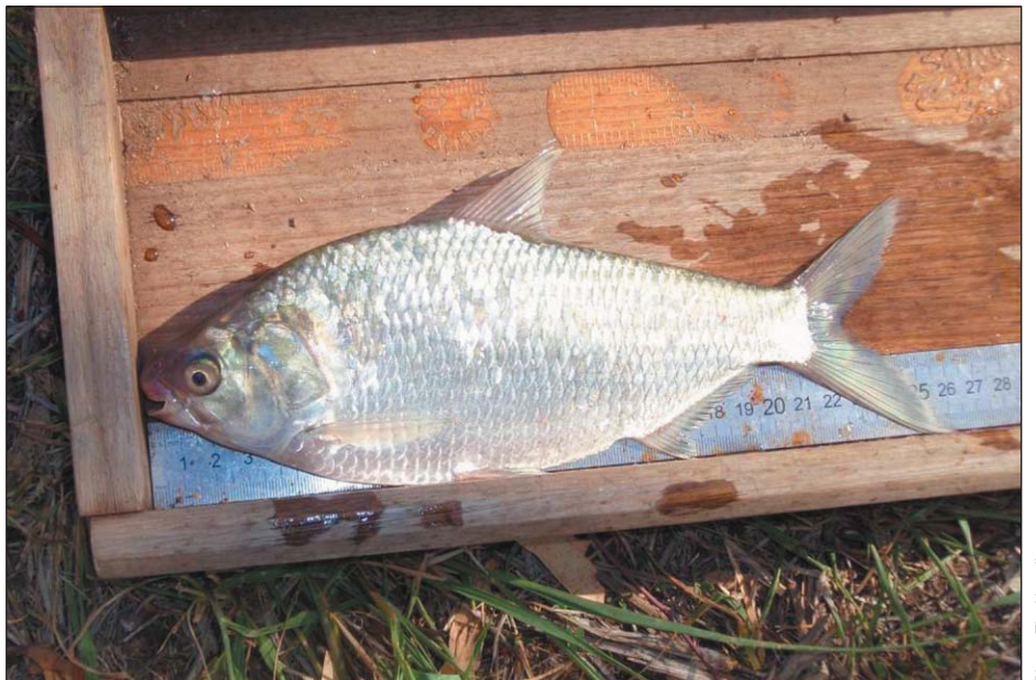
Plate 16.2 Bony bream ( Nematalosa erebi )