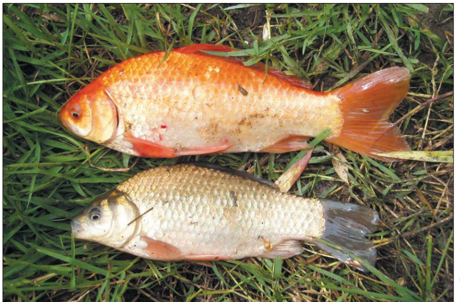
Plate 16.3 Goldfish ( Carasius auratus )